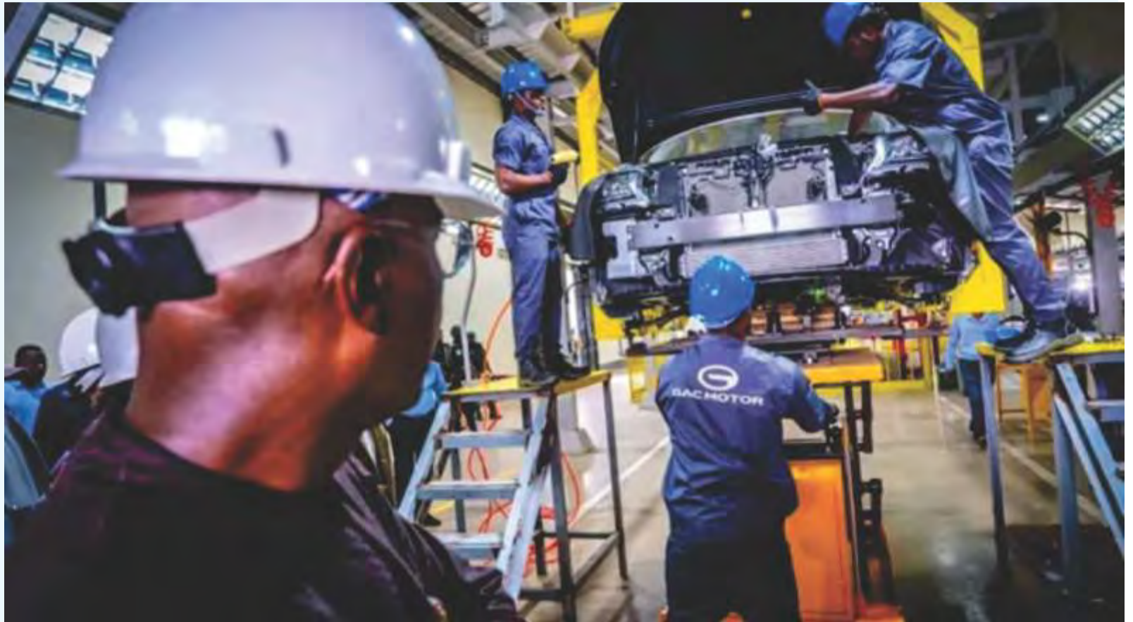
Governor Sanwo-Olu during the inauguration of GAC Assembly Plant

With the success story of LAGRIDE in which about 2000 Lagosians had benefited, Echonews gathered that the state government did not have any option than to activate the agreement it signed with the CIG motors to open an assembly plant where GAC car would be produced